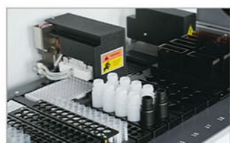
Microplate Reader & Washer Module Modularized automatic control reading and washing system.