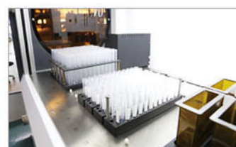
Sample & Reagent & Dilution Rack Module Original sample tubes available; Rack positions programmable.