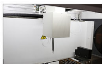
Sample Module Hitech teflon coating probe to prevent cross contamination.